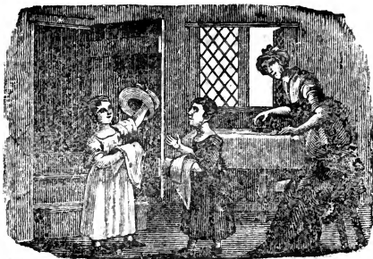
The Pink Bonnet.

where her sister was at work. "Is this my doll?" "Yes, Ellen," said Mary," it is the very doll whom you were pitying this morning because her frock was torn. Don't you think she looks quite genteel?" "Yes, I am sure she does," said Ellen. "What a pretty pink bonnet this is, and this beautiful frock, and these little cunning green slippers; you did n't make them all , did you?"